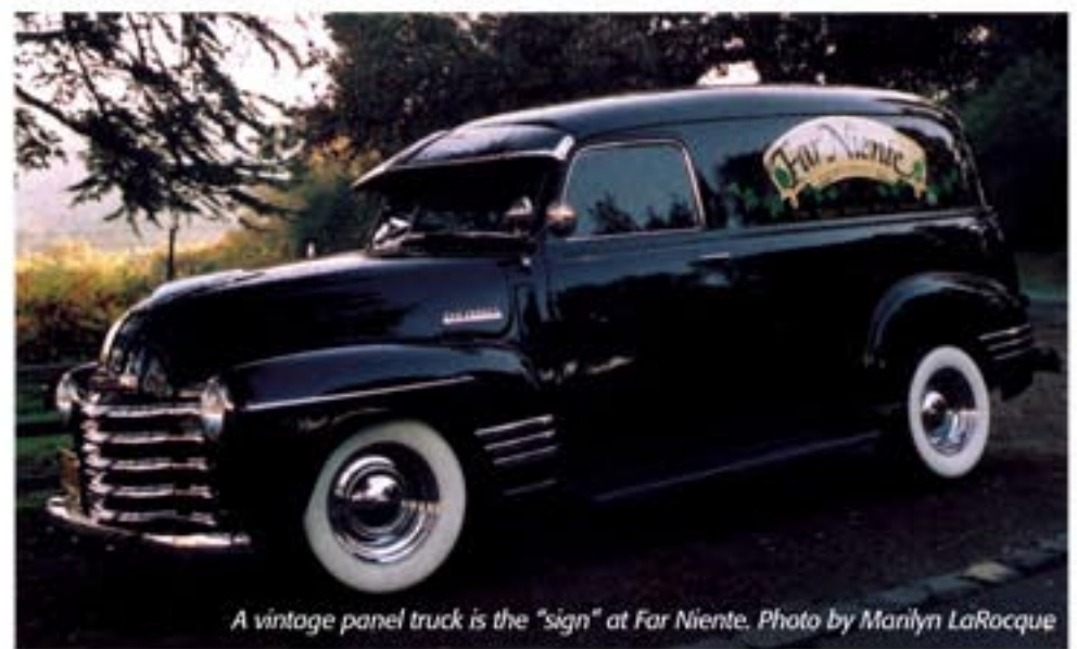
A vintage panel truck is the “sign” at Far Niente.

brick authentic to 1880s architecture. The interior design recreates the decor of the home of an affluent 19th century farmer.