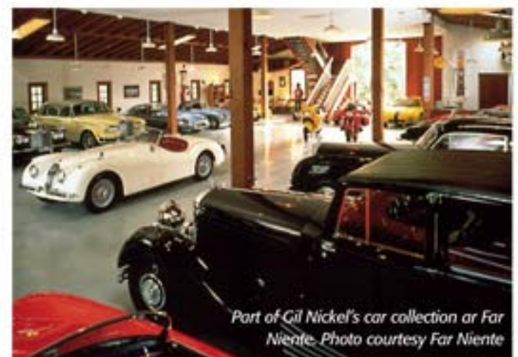
Part of Gil Nickel’s car collection at Far Niente.

Nickel & Nickel produces only 100% varietal, single-vineyard wines that express the terroir of their site. The winery’s “Terroir Tour” pours several wines of the same varietal and vintage