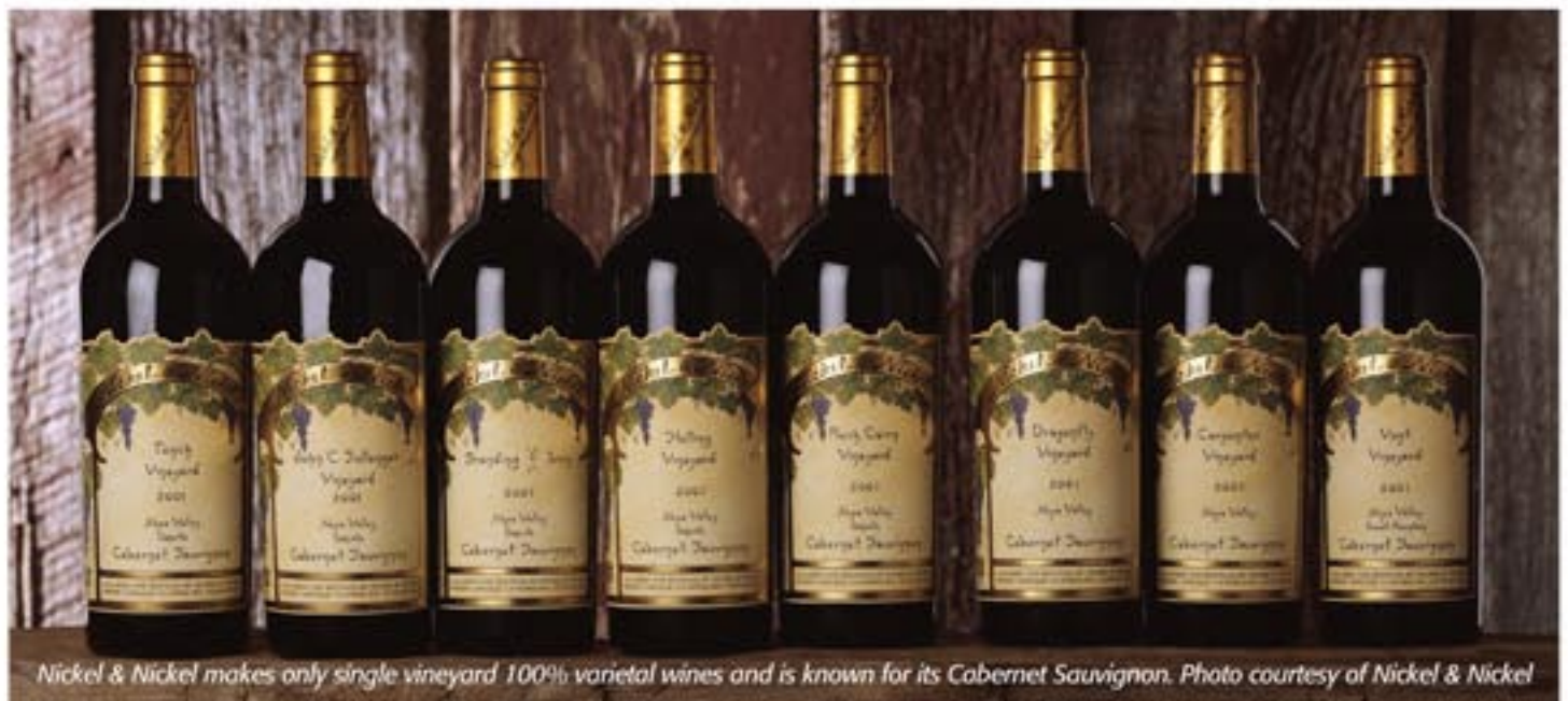
Nickel & Nickel makes only single vineyard 100% varietal wines and is known for its Cabernet Sauvignon.

The farmstead buildings were restored with meticulous attention to historic detail. The original exterior fish scale, sunburst, and rosette elements have been preserved on the Sullenger House. The new chimneys are constructed of